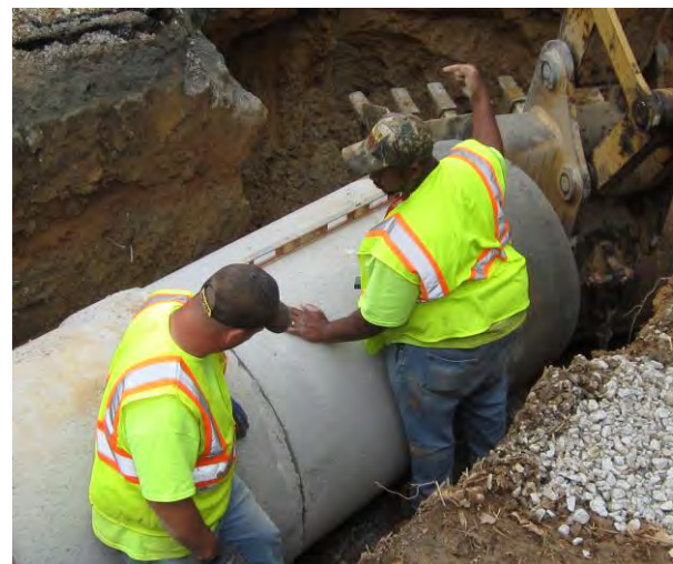
Post Construction Photo