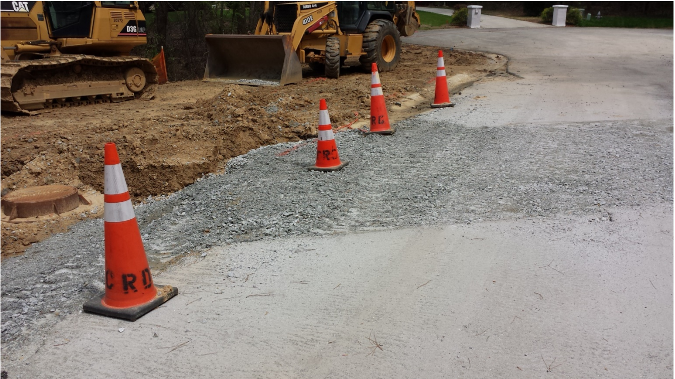
Photo 1: Grading work initiated to cover all newly installed structures.