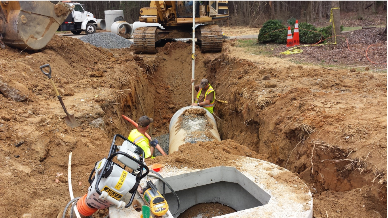
Photo 1: New concreted pipe and drainage structures continue to be installed.