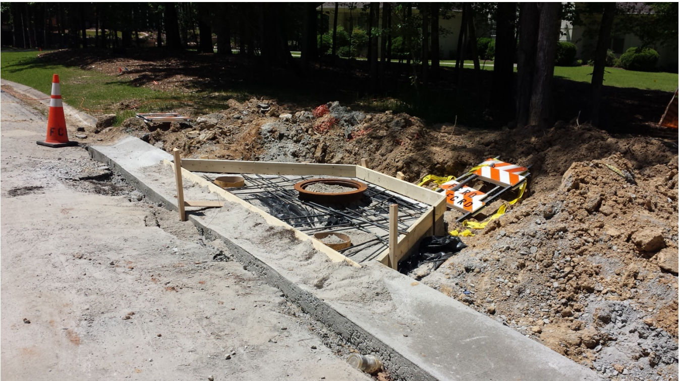
Photo 2: New curb and gutter was poured and catch basin lids are being formed for concrete pouring. (05/06/2015)