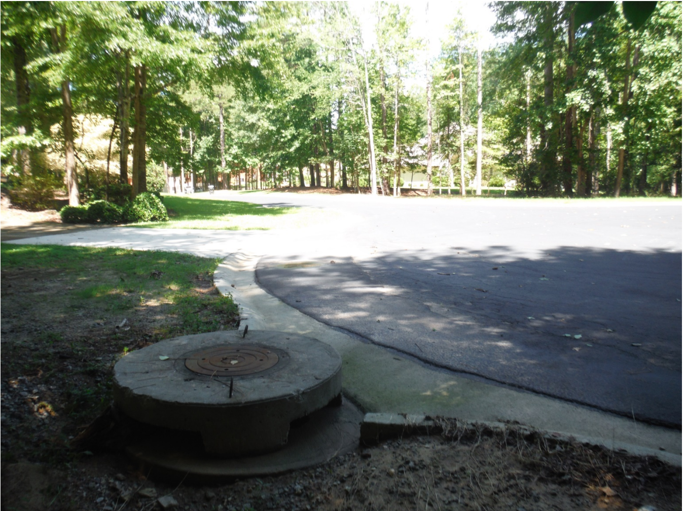
Photo 1: Lawson Lane project has been completed, by replacing existing pipe and installing additional drainage structures.