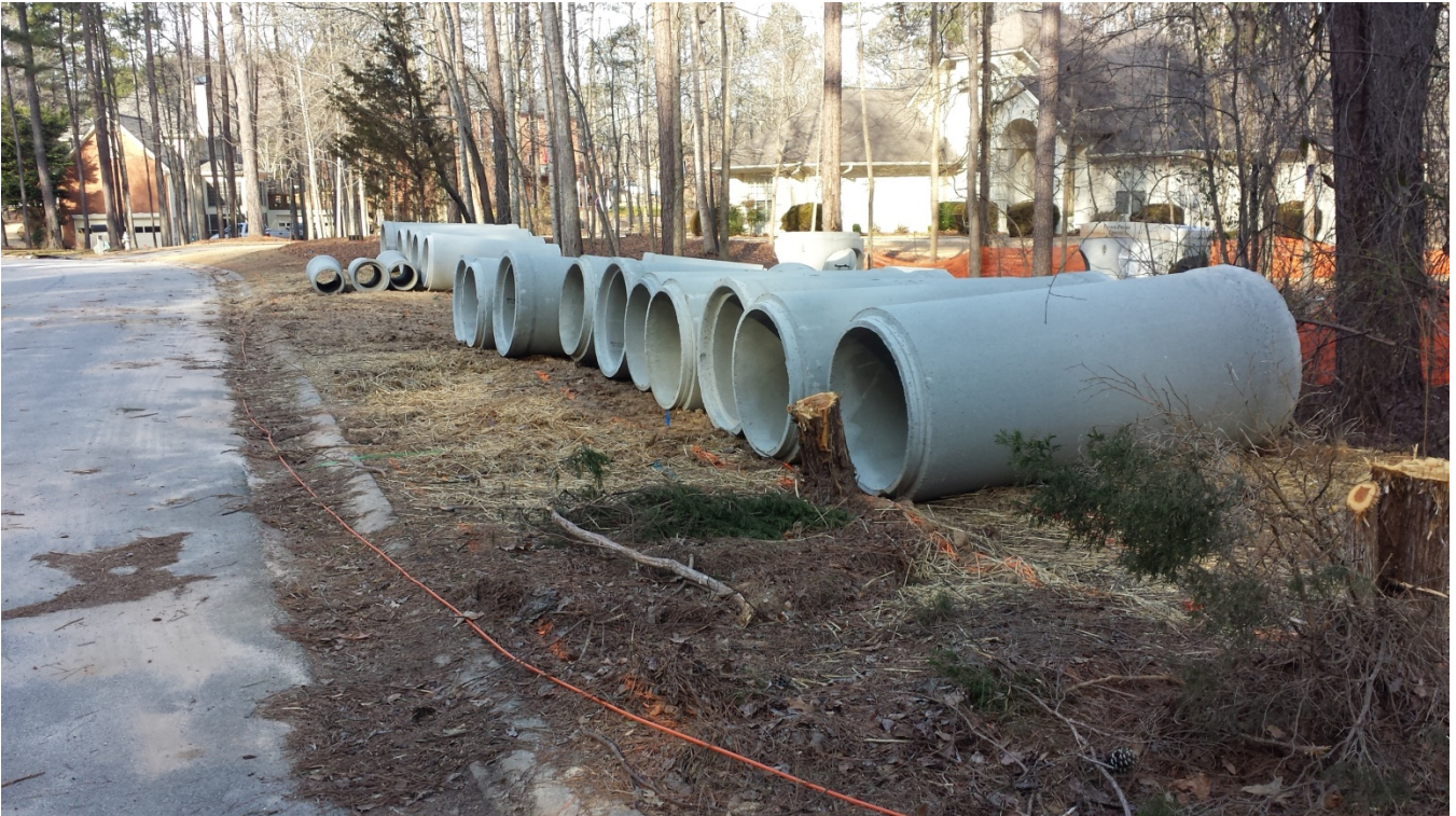
Photo 1: The new concrete pipe for Lawson Lane has been delivered to project location.