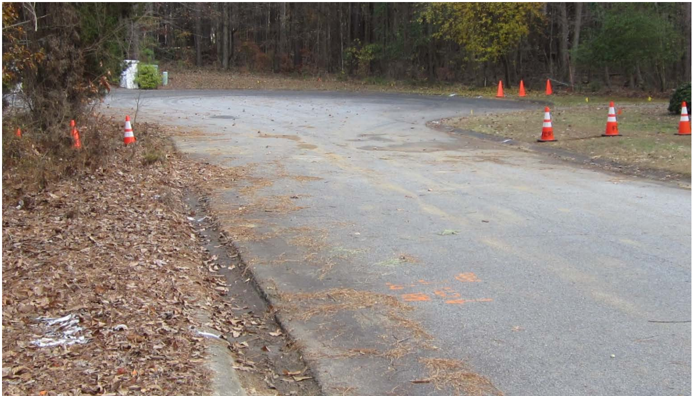
Photo 2: Pre-existing conditions. Undersized pipes in Northridge Subdivision results in flooding of road, lots and several homes along Lawson Lane. (12/03/2014)